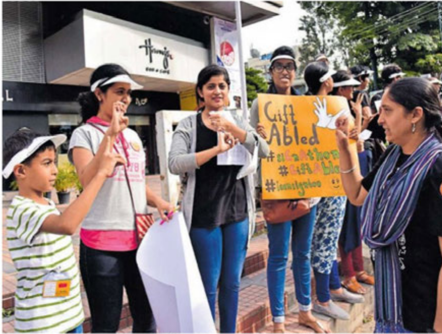
Volunteers take part in 'signsAthon - a silent human chain,' to create awareness on the needs of the disabled and to teach people sign language to mark the birth anniversary of Helen Keller at Koramangala on Sunday.