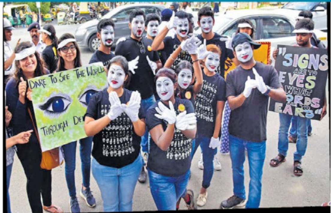
committed: Young people are increasingly coming out on the streets to create awareness on social issues. (Above) College students miming about the problems of the differently-abled recently.