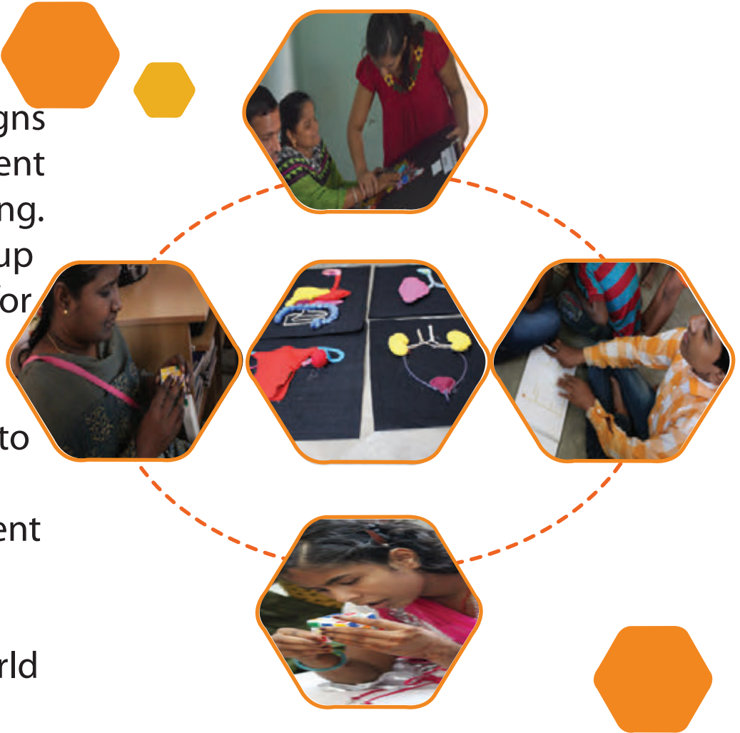
Siddaganga Blind School, Tumkur

We aim to reach such books to the rural parts of India by encouraging this advancement in learning. This will serve thousands of children and adults to understand the world around them better.