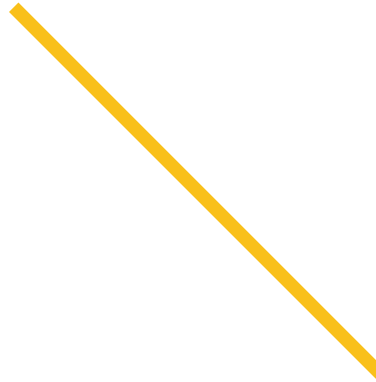
Left Slanting Line