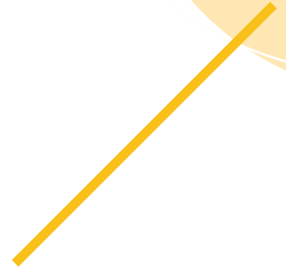
Right Slanting Line